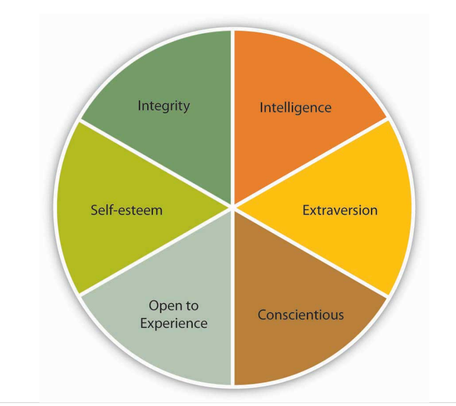
Figure 10.5 Traits Associated with Leadership

Research also shows that people who are effective as leaders tend to have a moral compass and demonstrate honesty and integrity.Reave, L. (2005). Spiritual values and practices related to leadership effectiveness. Leadership Quarterly , 16 , 655–687.